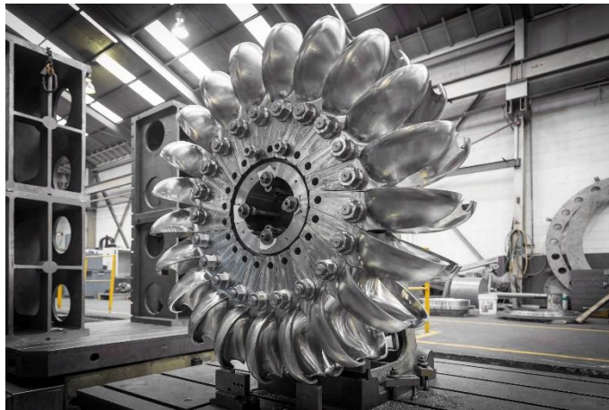
Hydroworks – Contract Bonding