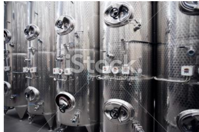
Wine Technology – Loan Guarantee