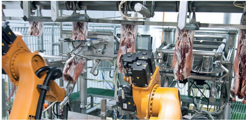
Scott Technology – Export Credit Guarantee