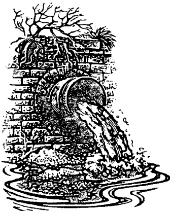
That ceaselessly spews