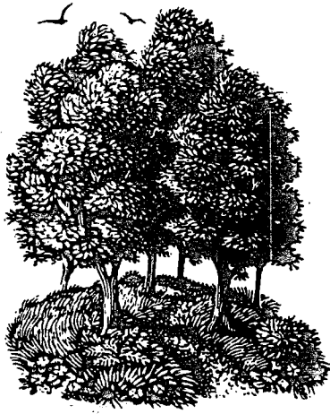
These are the trees