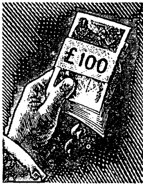
With interest accrued on their savings