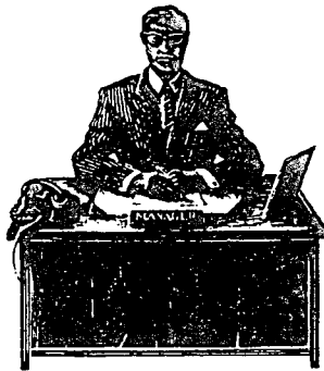
Which their bank had lent